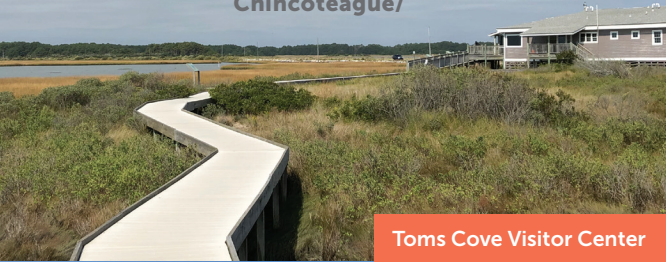
Toms Cove Visitor Center

To learn more about Chincoteague National Wildlife Refuge and it's beaches, find news updates and current conditions, visit the website: https://www.fws.gov/refuge/Chincoteague/